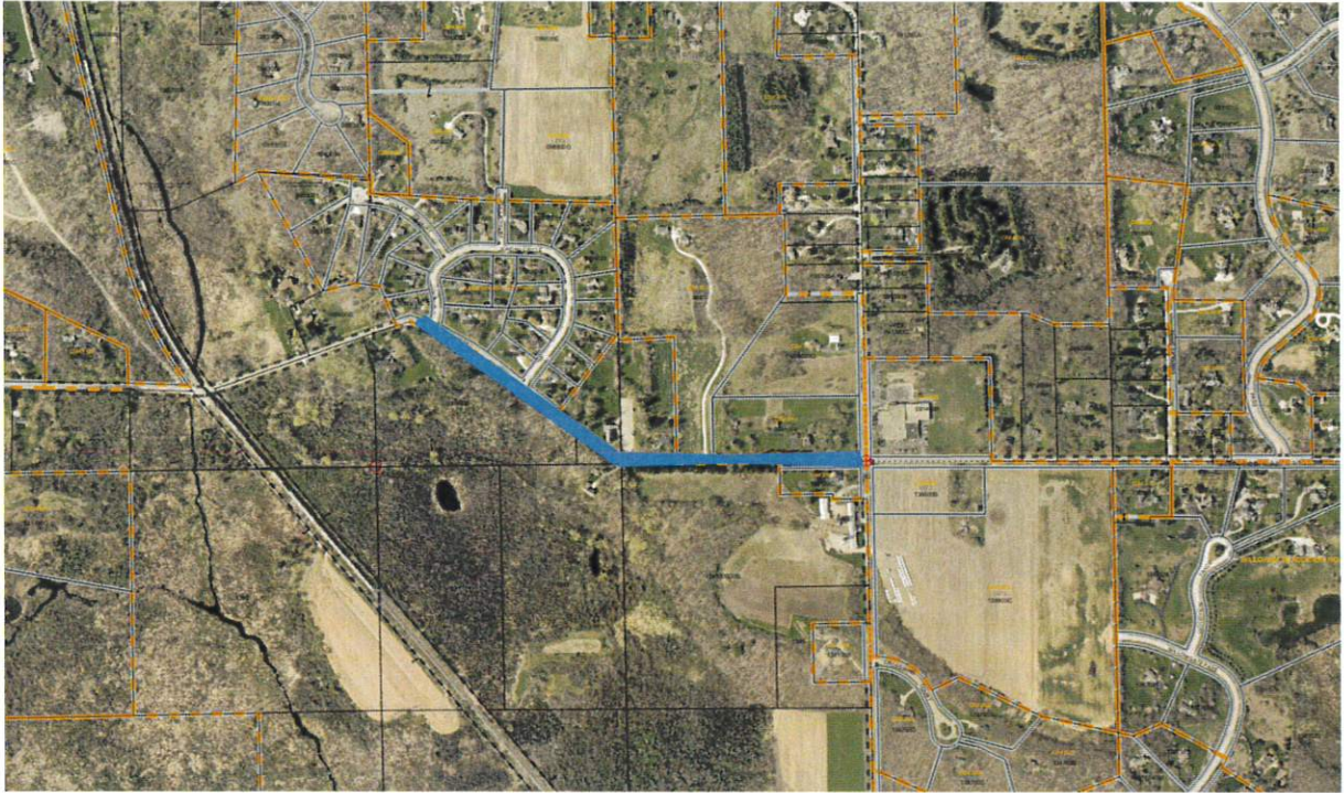
EXHIBIT C: WILLOW CREEK ROAD