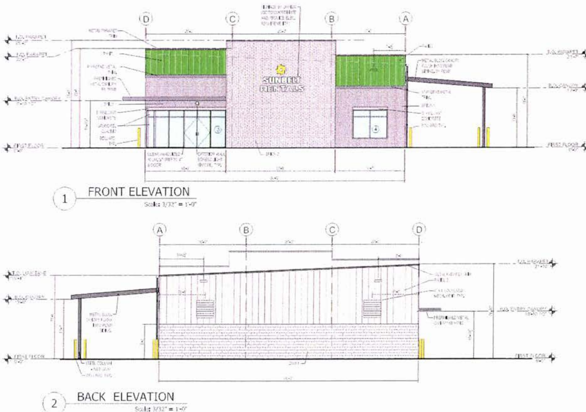
Figure 1: Proposed Front and Rear Elevations.

While 100% masonry has not been achieved here, the Planning and Zoning Commission may discuss the appropriateness of the materials proposed/selected and the overall design provided by the Code language referenced above. Overall, staff is generally supportive of the elevations/design. The proposal is in general conformance with surrounding properties and recently approved new construction proposals within the general area. The applicant has made an effort to blend their corporate/franchise exterior design model with the City's Architectural and Design Standards to meet the spirit and intent of the Code. Additionally, the applicant has provided a justification statement regarding the material selection in correlation to the masonry requirement. That statement is included in this report packet.