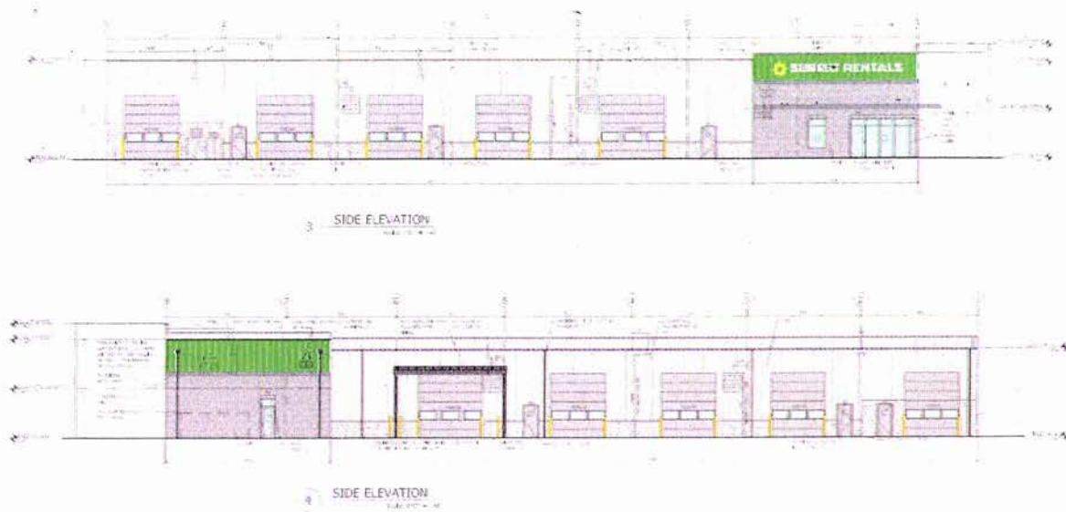
Figure 2: Proposed Side Elevations.