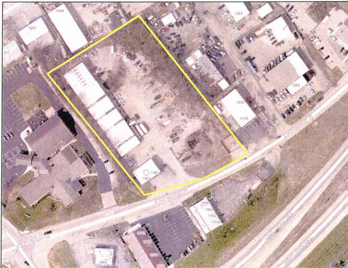
Figure 4: Aerial Photo of the Subject Property.