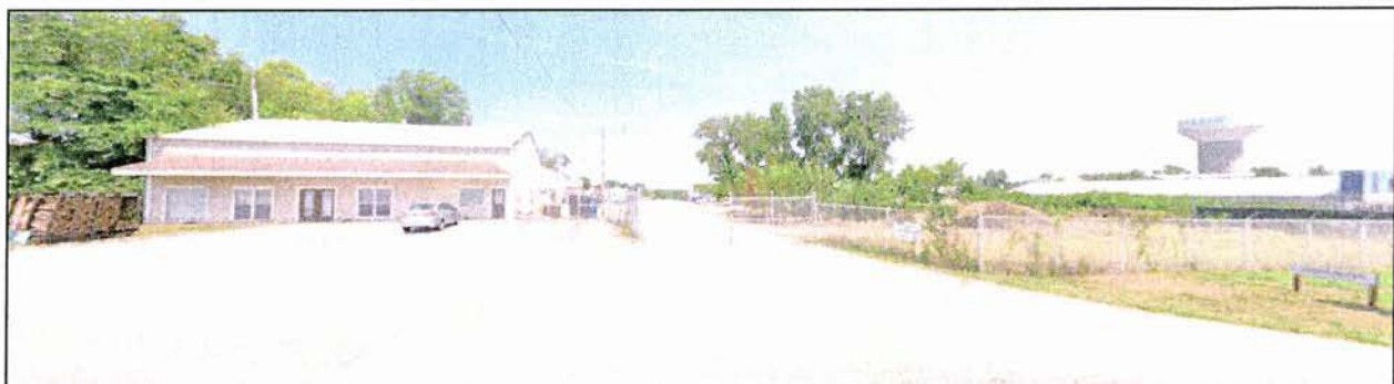
Figure 5: Existing site photo.