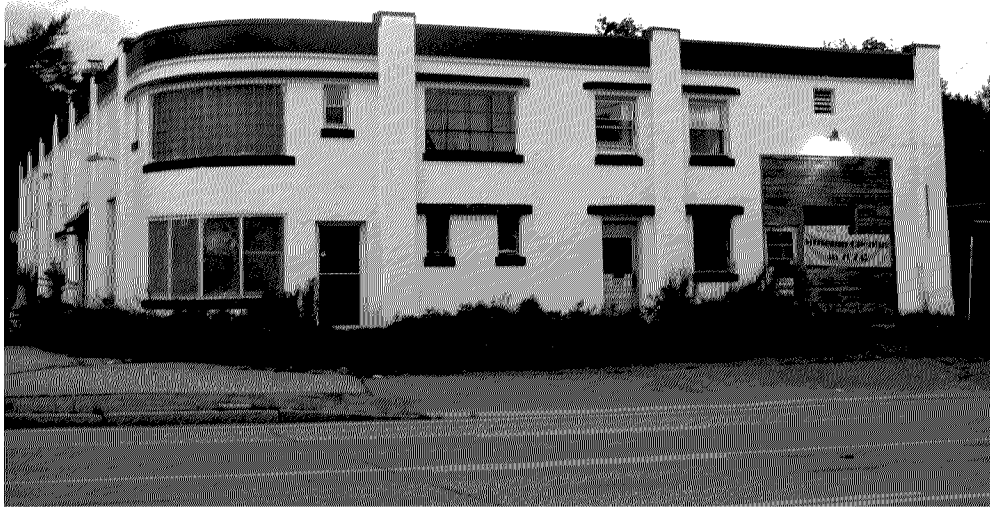
Recent photo of 490 Broadway