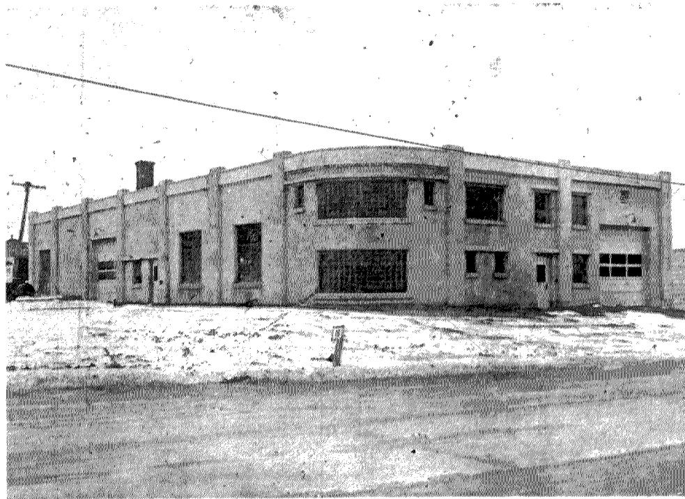
NEW BUS GARAGE OF HASEY'S MAINE STAGES —Perhaps the most modern heated garage unit in Maine, this new structure on outer Broadway is designed as a bus garage for Hasey's Maine Bus Lines. It is heated by the latest methods of reflective heat.