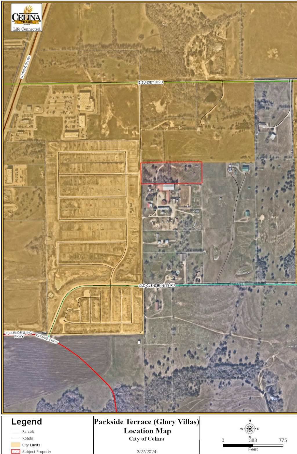
Exhibit B Depiction of Property