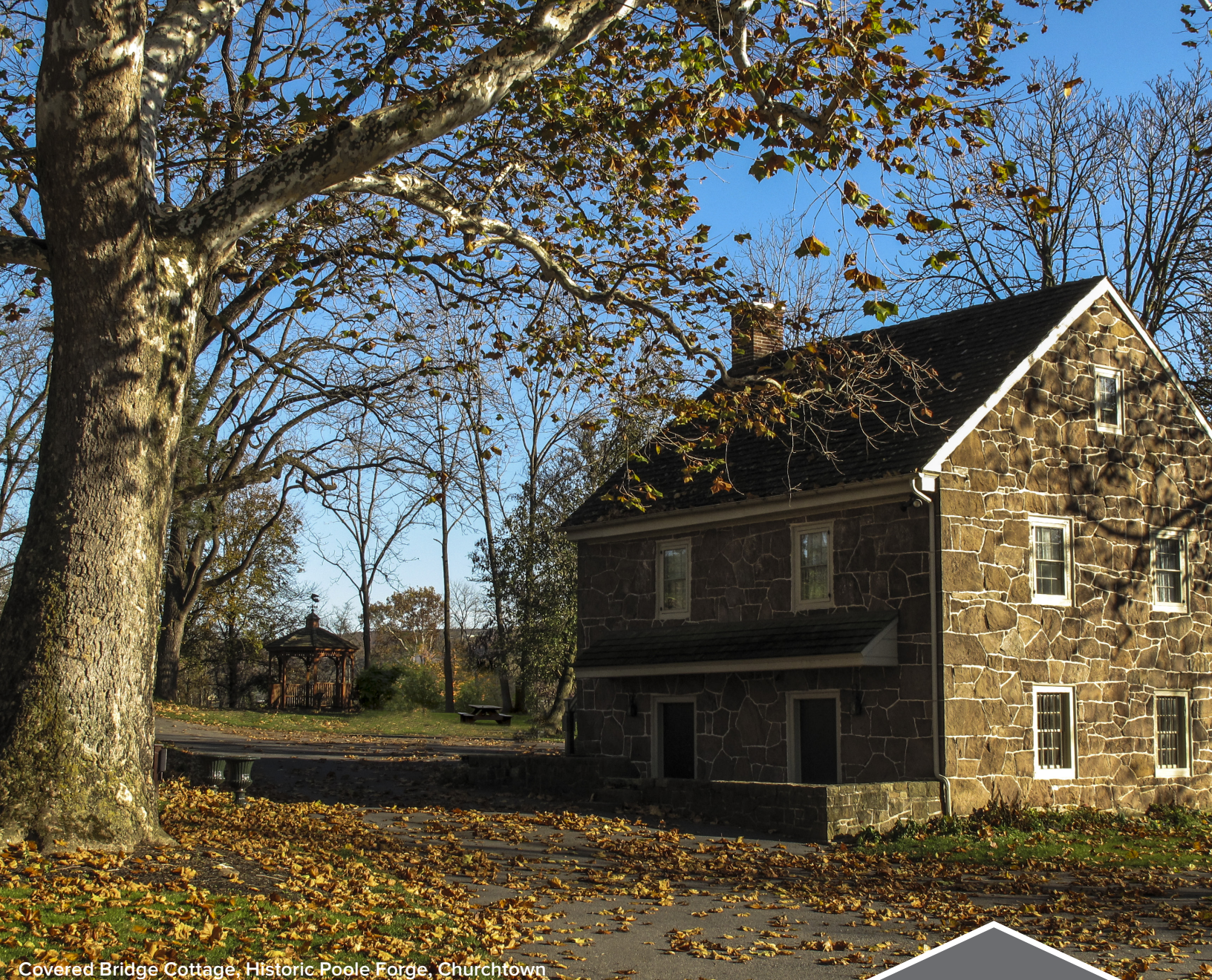
Covered Bridge Cottage, Historic Poole Forge, Churchtown