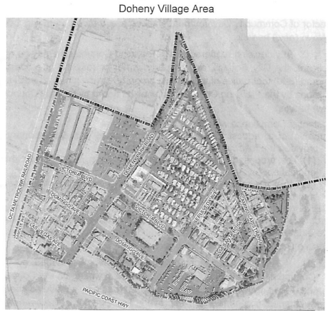
Figure 9.63.030 Doheny Village Area