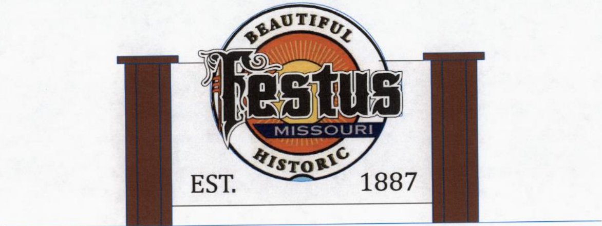
Entrance Sign SCALE: 1/2" = 1'