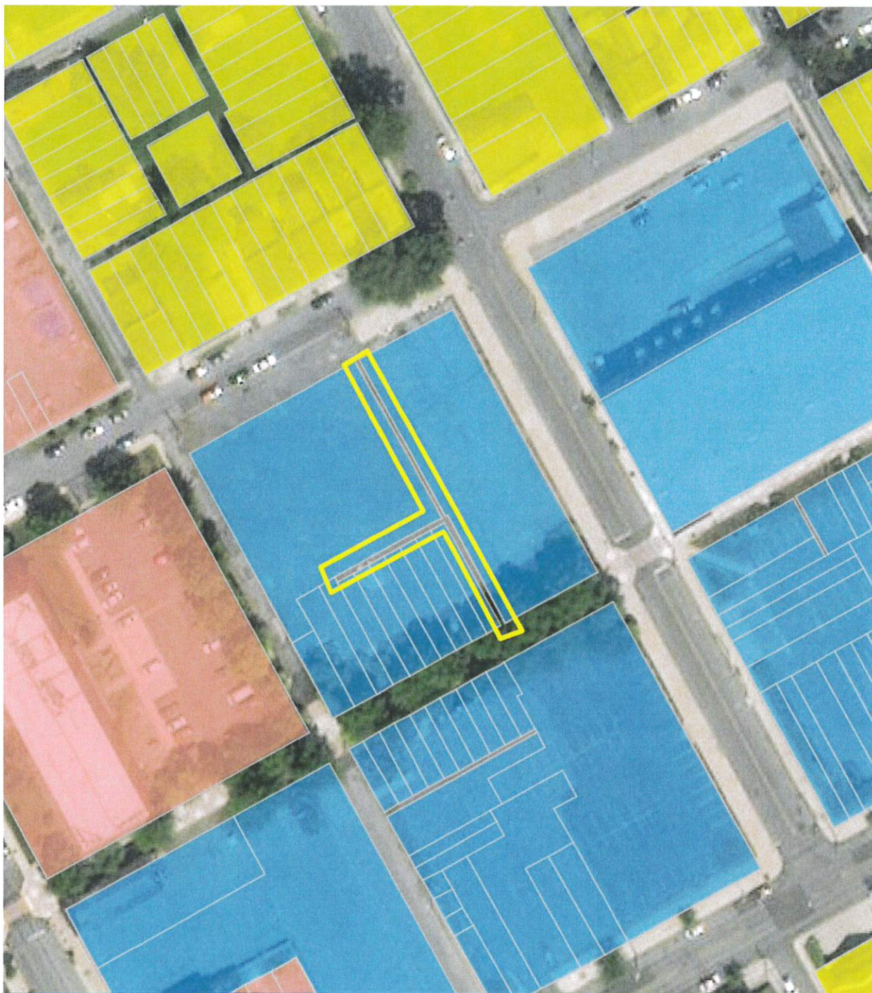
Zoning & Location Map 300 block of Harris Street