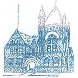
City Hall 1896-1968

City of West Haven 355 Main Street West Haven, Connecticut 06516