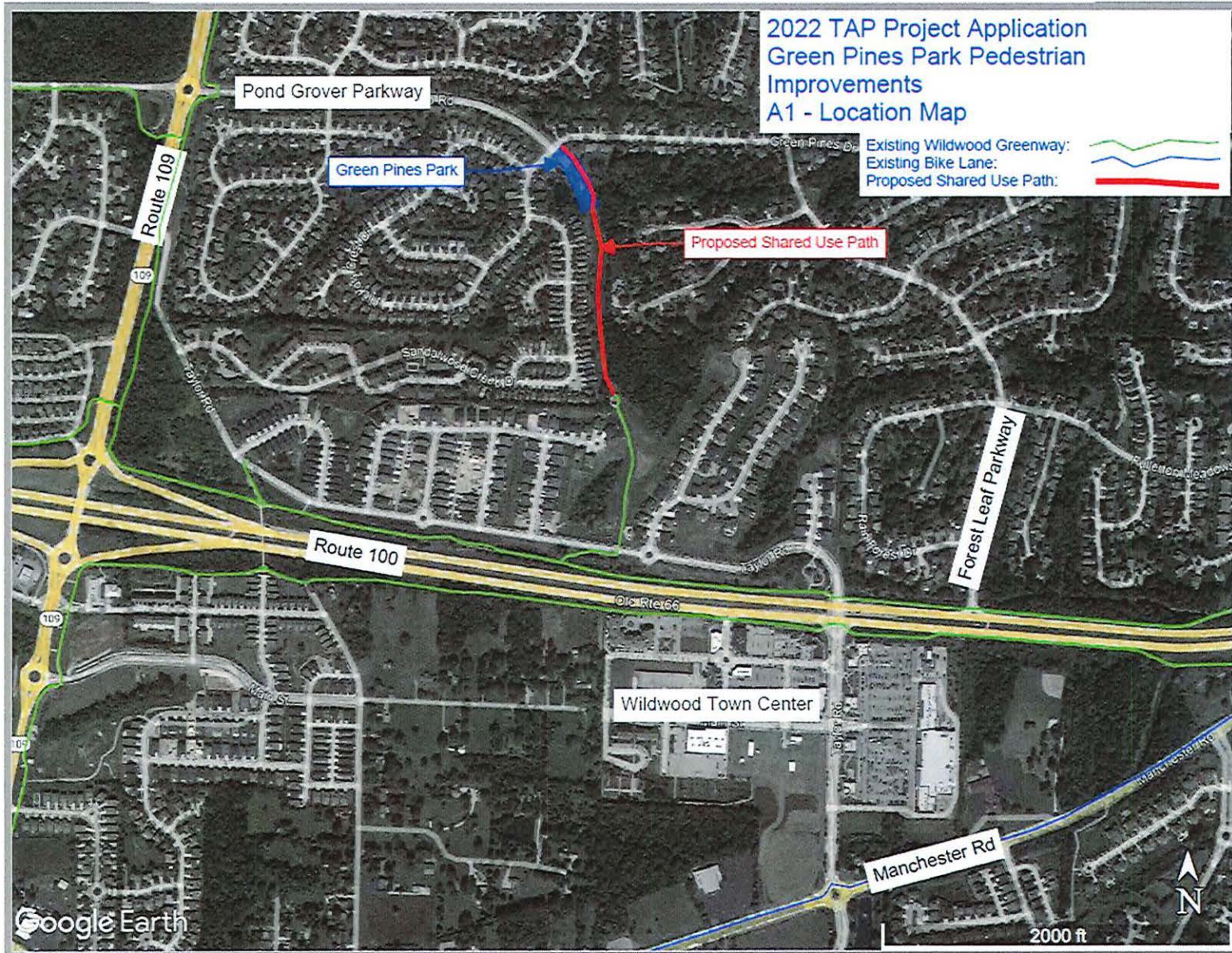
Exhibit A - Location of Project