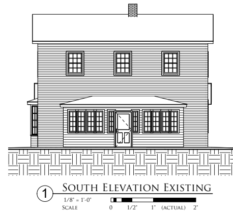
① SOUTH ELEVATION EXISTING 1/8" = 1'-0" SCALE 0 1/2' 1' (ACTUAL) 2'