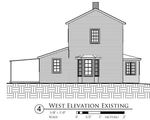
④ WEST ELEVATION EXISTING 1/8" = 1'-0" SCALE 0 1/2' 1' (ACTUAL) 2'