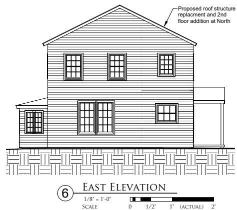
⑥ EAST ELEVATION 1/8" = 1'-0" SCALE 0 1/2' 1' (ACTUAL) 2'