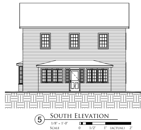
⑤ SOUTH ELEVATION 1/8" = 1'-0" SCALE 0 1/2' 1' (ACTUAL) 2'