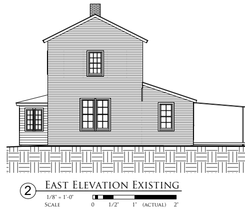
② EAST ELEVATION EXISTING 1/8" = 1'-0" SCALE 0 1/2' 1' (ACTUAL) 2'