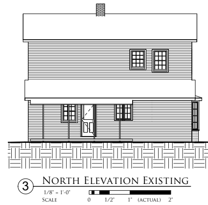
③ NORTH ELEVATION EXISTING 1/8" = 1'-0" SCALE 0 1/2' 1' (ACTUAL) 2'