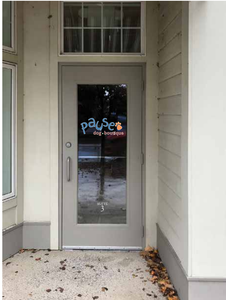
ENTRY DOOR GLASS WIDTH - 21.5"W